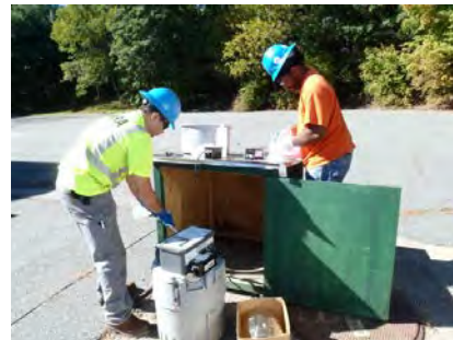
Figure 2- Wastewater characterization sampling

Total number of non-industrial events = 1690