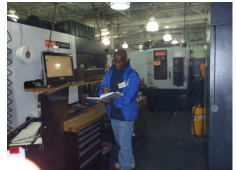
Figure 1. Inspection of a permitted industrial user.

Total Industrial Facility visits = 752 • Annual inspections of SIUs = 214 • Other SIU inspections 1 = 52 • Non-SIU inspections = 320 • Audits of G1 facilities = 14 • Audits of G2 (food processors) facilities conducted = 6 • Industrial Survey inspections 2 = 119 • Visits with no inspections 3 = 26