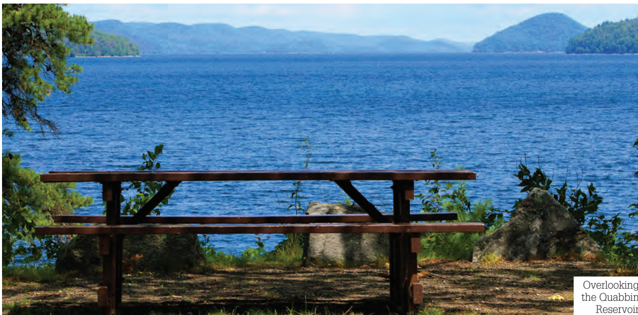
Overlooking the Quabbin Reservoir

Protection keeps the water supply clean and safe while providing open space. All of the trees and protected land in the Quabbin, Wachusett and Ware River watersheds act as a natural filter, and it is one of the reasons MWRA water has been rated as the best in the country. Since 1985, almost $150 million has been invested in land protection.