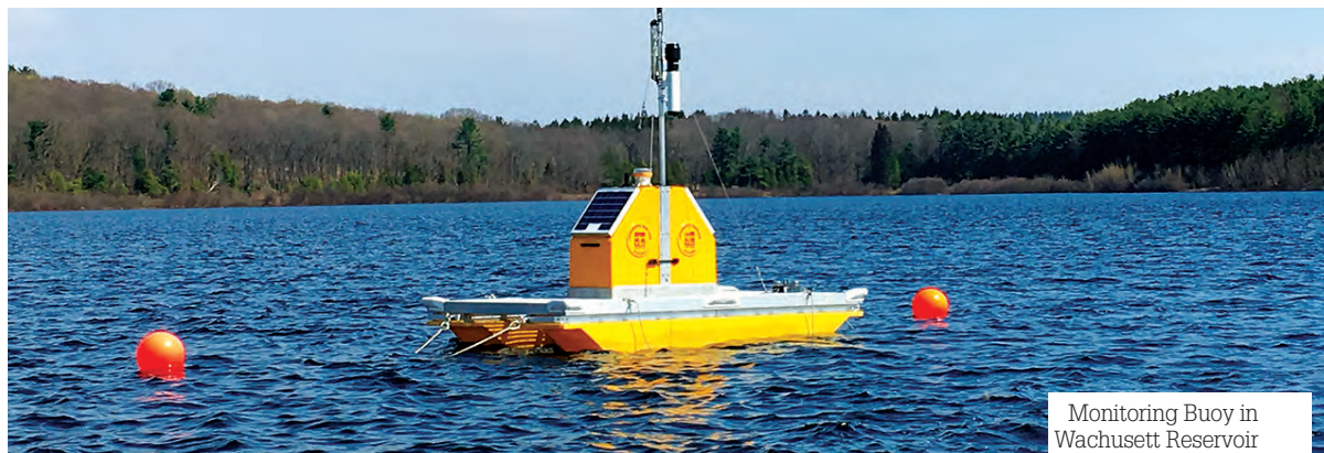
Monitoring Buoy in Wachusett Reservoir

We know that conservation works. Customers in the MWRA service area have reduced their average daily demand from 340 million gallons per day in 1980 to about 200 million gallons today. It is important that these conservation efforts continue – especially during dry periods.