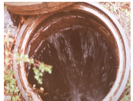
Inflow into a Sewer Manhole

Inflow is extraneous flow entering the collection system through point sources and may be directly related to storm water run-off from sources such as roof leaders, yard and area drains, basement sump pumps, ponded manhole covers, cross connections from storm drains or catch basins, leaking tide gates, etc. Inflow causes a rapid increase in wastewater flow that occurs during and continuing after storms and extreme high tides. The volume of inflow entering a collection system typically depends on the magnitude and duration of rainfall, as well as related impacts from snowmelt, flooding, and storm surge.