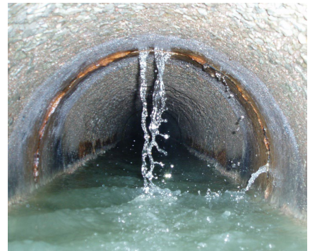
Infiltration in a Sanitary Sewer

Infiltration is groundwater that enters the collection system through physical defects such as cracked pipes/manholes or deteriorated joints. Typically, many sewer pipes and sewer service laterals are below the surrounding groundwater table. Therefore, leakage into the sewer (infiltration) is a broad problem that is difficult and expensive to identify and reduce.