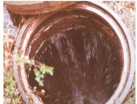
Inflow into a Manhole

Inflow is extraneous flow entering the collection system through point sources and may be directly related to storm water runoff from sources such as roof leaders, yard and area drains, basement sump pumps, ponded manhole covers, cross connections from storm drains or catch basins, leaking tide gates, etc. Inflow causes a rapid increase in wastewater flow that occurs during and continuing after storms and extreme high tides. The volume of inflow entering a collection system typically depends on the magnitude and duration of rainfall, as well as related impacts from snowmelt, flooding, and storm surge.