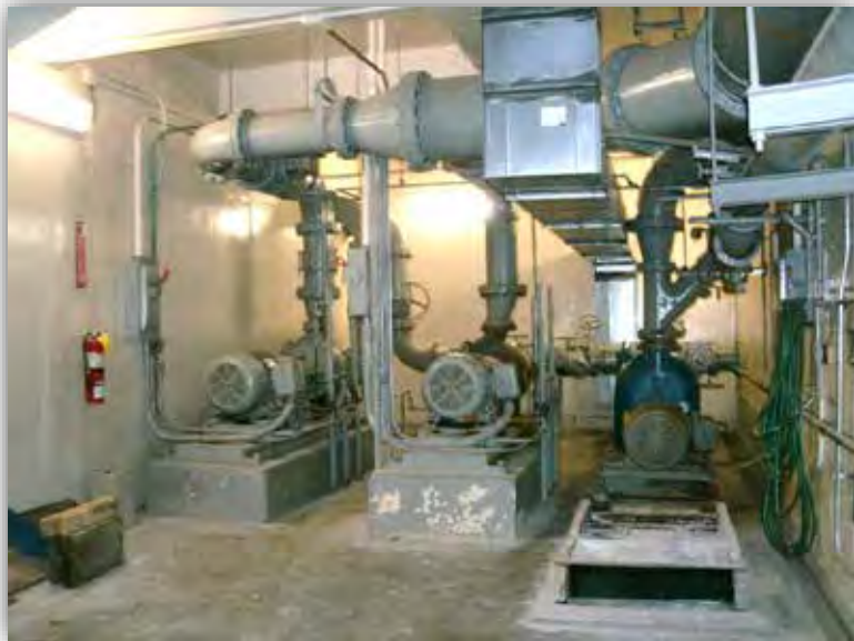
Dry Weather and Dewatering Pumps to be Replaced