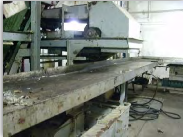
Replacement of Conveyor System