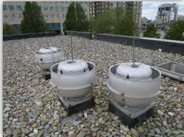
Replacement of Chemical Building Roof and Installation of Chemical Tank Access Hatches