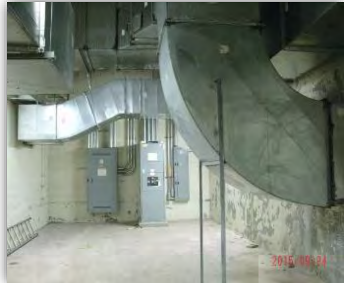
Relocation of Electrical Room