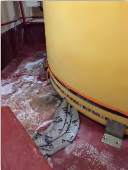
Replacement of Leaking Chemical Tanks