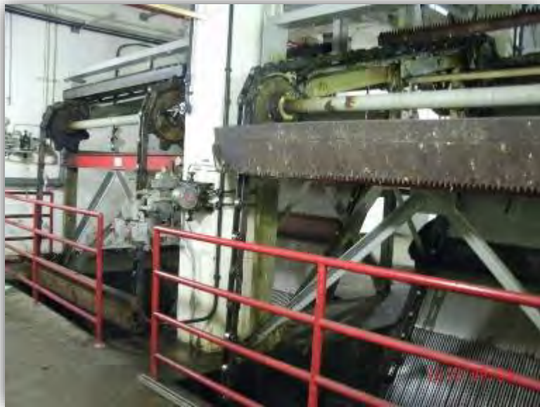
Catenary Bar Screens to be Replaced