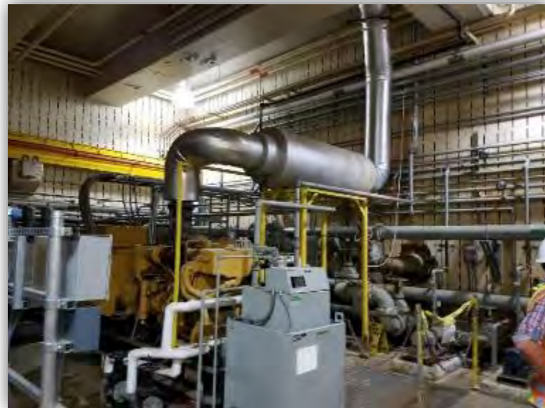
Generator to be Replaced