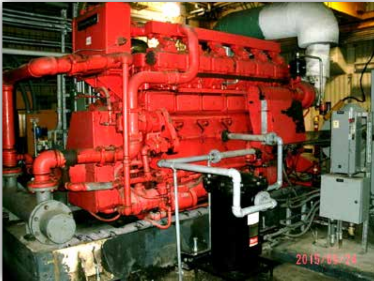
Storm Pump Engine to be Replaced