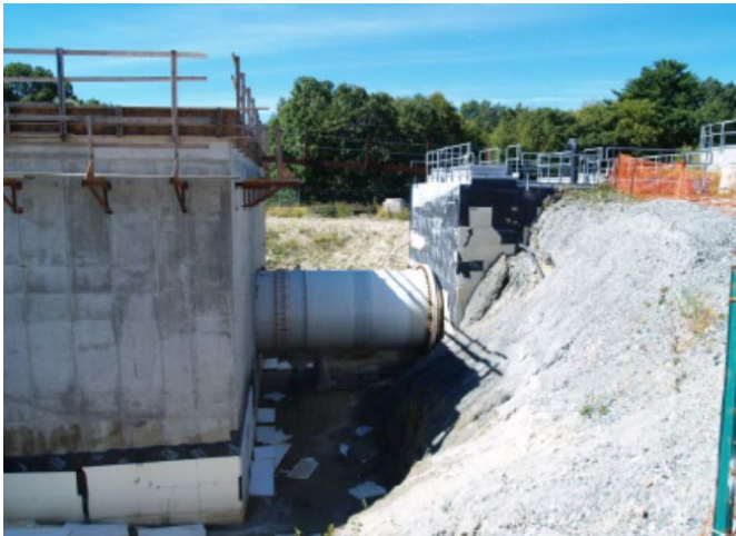
Figure 1. Existing Configuration of Shaft L